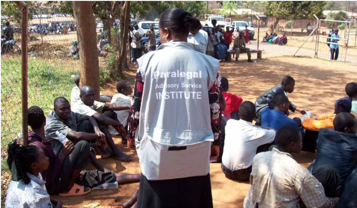
A paralegal providing legal advice and assistance at a Magistrates Court.