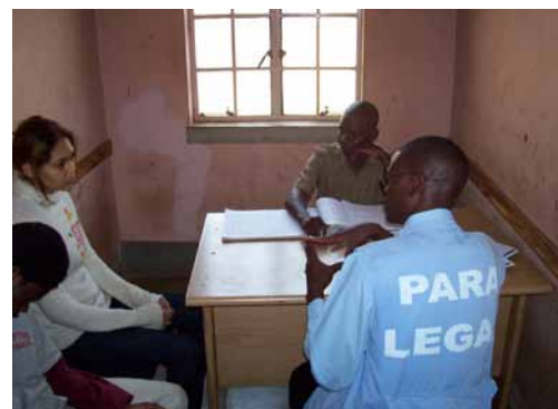
A paralegal attending a Police interview of a child offender at police station ©PASI, Malawi

Alternative dispute resolution mechanisms have been successfully utilized to avoid litigation and to expand the options for vulnerable individuals to access justice while maintaining harmony with their communities. For instance, widows and orphans are at times reluctant to take cases to the formal systems for fear of being perceived as airing family matters to outsiders - which might lead to their being shunned in the future. 57 However, the absence of standards, guidelines and an oversight mechanism for mediation can result in poorly mediated processes that are instead injurious to the poor and vulnerable groups especially where cases are "settled but not resolved" and may encourage forum shopping and allowing disputes to fester.