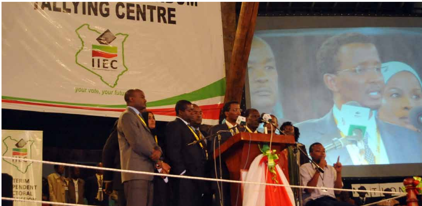
Constitution Making Process, Kenya.