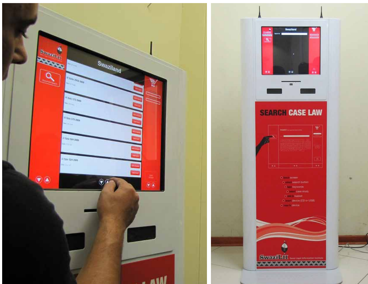
Freedom Toaster which is a kiosk that provides access to case law to those without internet connection.

This computerization will require massive expenditure on expensive court systems. Currently, basic ICT infrastructure is often lacking and funding unavailable. On the other hand, it should be noted that Internet penetration in Africa is growing exponentially and currently stands at 10.9%. 75 This provides opportunities for faster and cheaper alternatives to expensive systems. In Kenya, some promising work is being carried out in less costly Intranet-based open court systems. Initiatives exist using SMS texting, as in eastern DRC, to inform victims of crime of court decisions making use of a fast growing mobile market. This is a potentially viable and cost-effective alternative to explore. 76