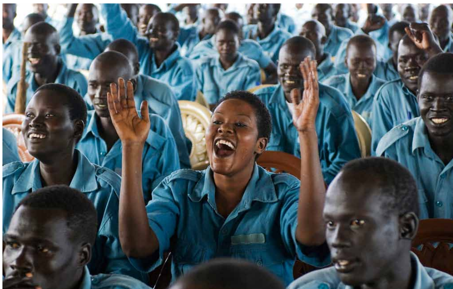
South Sudan

Integrated justice system reform is critical to ensuring that root causes and barriers are identified and addressed holistically and that justice systems operate effectively. Additionally, strong leadership is critical for pushing through bold reforms that move beyond establishing legal and policy frameworks and building institutions to strengthening service delivery, and ensuring that the public accesses and utilizes the services of the justice institutions.