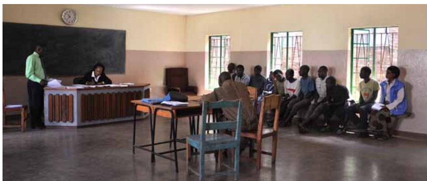
Paralegal Advisory Services Institute on Camp Court facilitated by PASI in progress