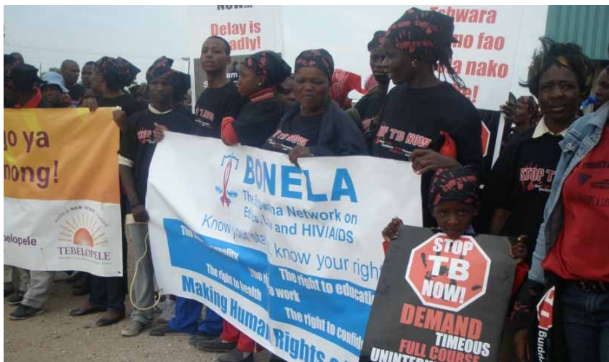
BONELA raises awareness and understanding around HIV issues also through public campaigns and forums.